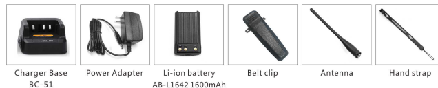
Charger Base BC-51