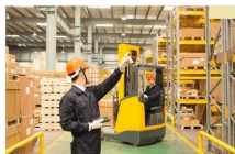
Logistics and warehousing